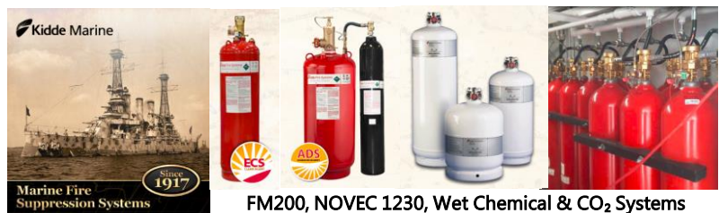
FM200, NOVEC 1230, Wet Chemical & CO 2 Systems